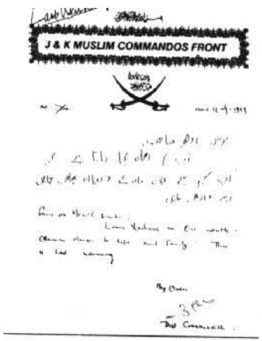
The terrorist's intimidation: Leave Kashmir in one month otherwise danger to life and family. This is Last Warning. By Order Dist. Commander