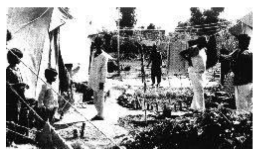
One of many refugee camps at Jammu.